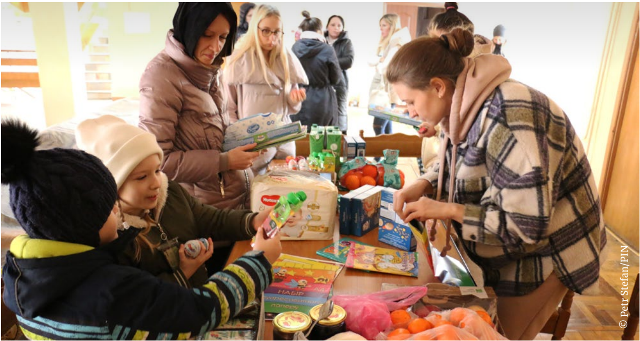
Ukraine: Collective centre in Western Ukraine where mostly women and children stay who fled from areas of active conflict.